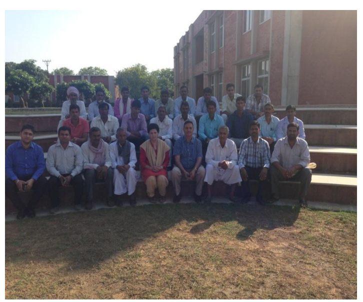
Primary processing trainees at lunch and group photo