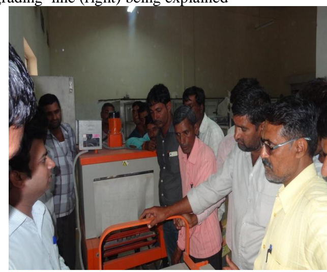
Conveyer belt to receive fruits after automatic grading (left) and cutting machine (right)