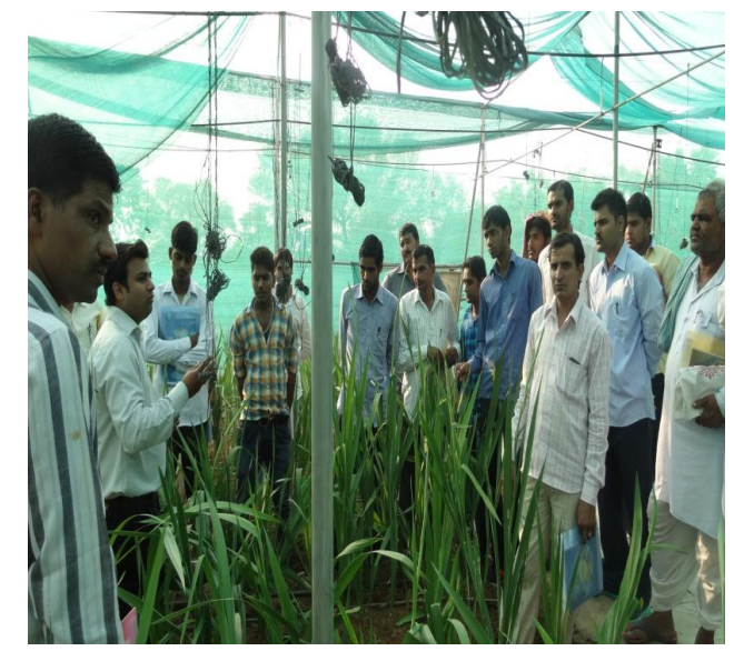
Hi-tech production training, clockwise: Chrysanthemum cultivation, seedling in plugs/ trays, Rose, Glads