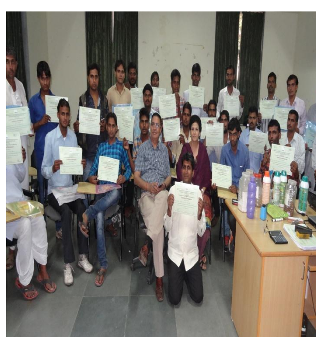
Certificate distributions to Hi-tech production participants and group photograph