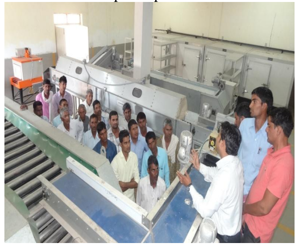
Visit to processing lab above (left) & fruit grading line (right) being explained