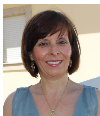
Title of the talk: