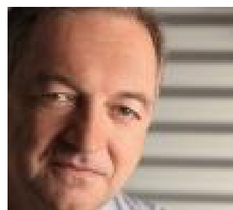
Title of the talk: