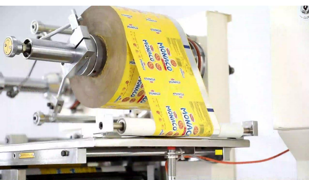
Biscuit Wrapping Machine