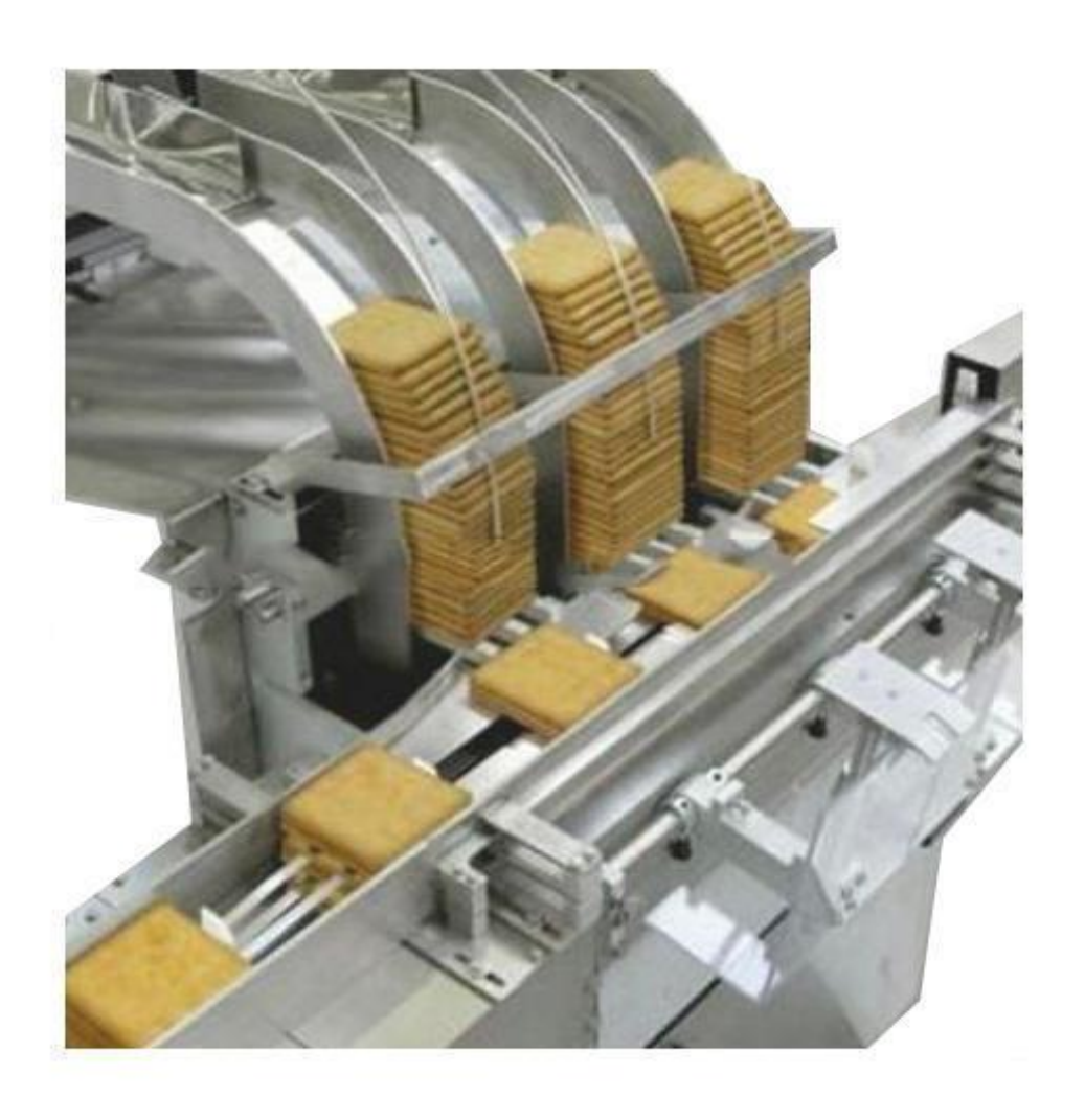
Automatic Filling Machine