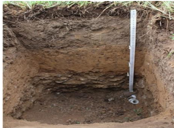
WELL DRAINED SOIL