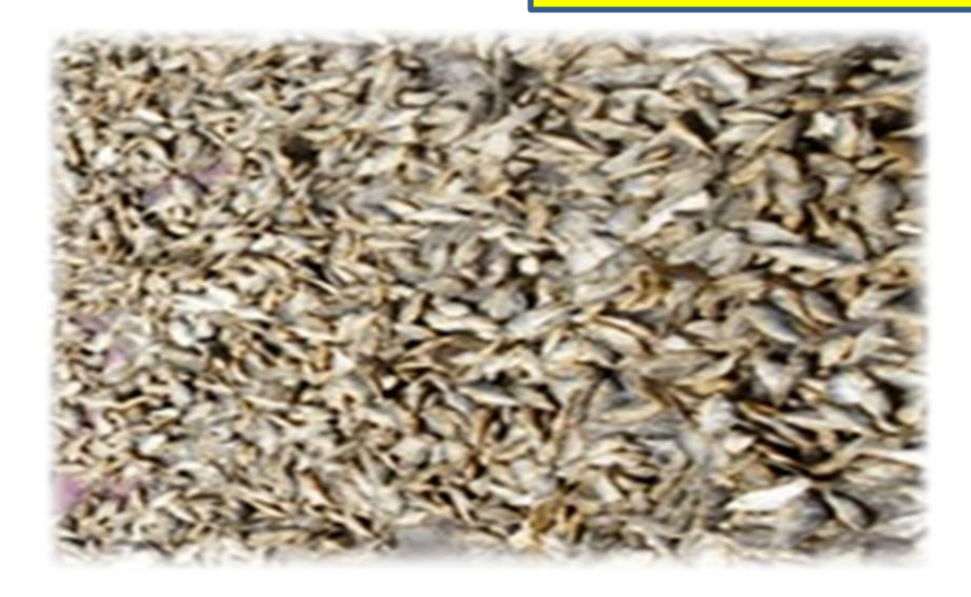
Right time of Sheedal production

Actually dry Puntius and phasa fish are available in the market from December. Therefore, December to February is the right time for production of Sheedal. This may be extended upto April, before onset of rainy season.