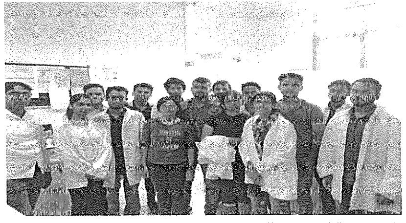
GLIMPSE OF ENTREPRENEURSHIP AWARENESS CAMP