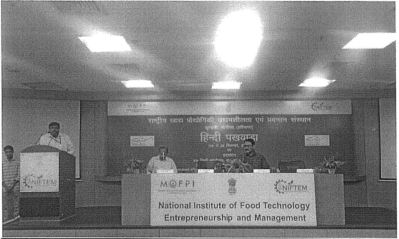
Inaugural session of Hindi Pakhwada (14 th - 28 Sep,2018)