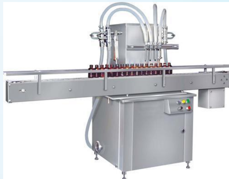
Semi Automatic Filling Machine