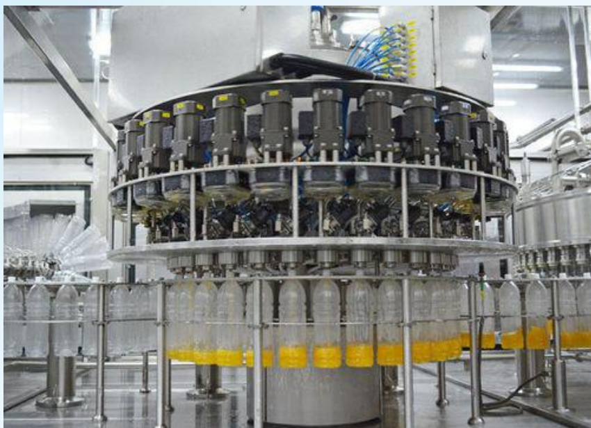
Fully Automatic Filling Machine