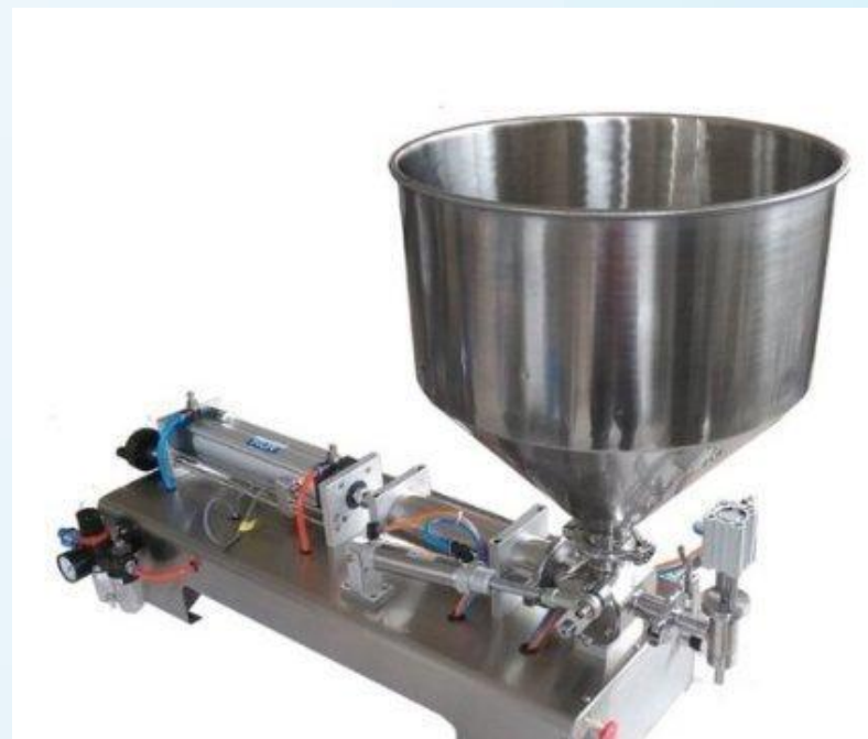
Semi Automatic Filling Machine for Pickle