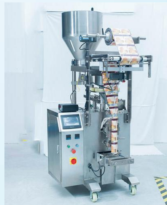
Semi Automatic Filling Machine for Pakkavada