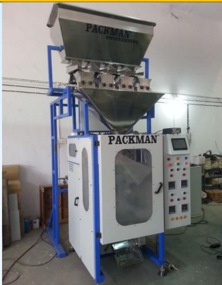
Fully Automatic Filling Machine forPakkavada