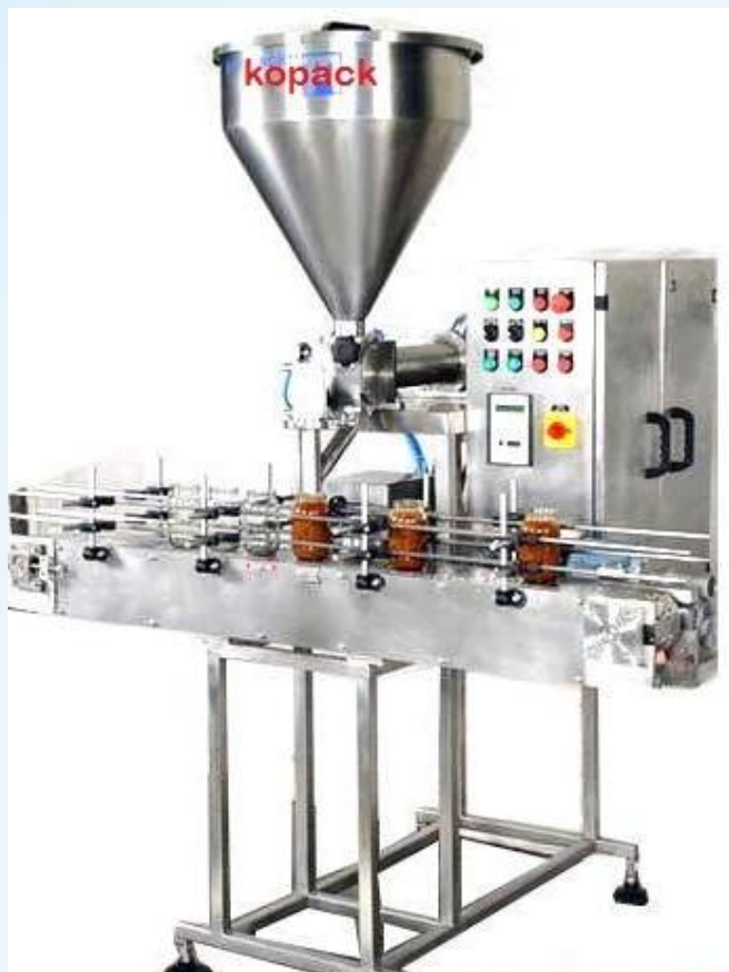
Fully Automatic Filling Machine for Pickle