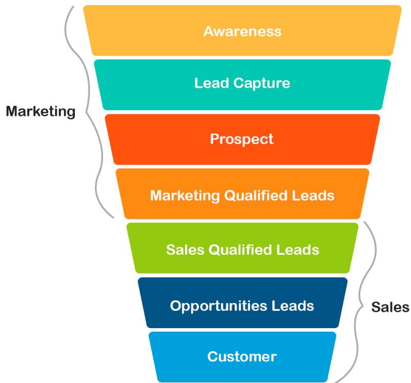
Figure 1 Creating a Lead Funnel

A lead funnel can be created as mentioned in the figure from creating awareness to capturing lead, prospect building and segregating MQLs. First four stages belong to the marketing while the bottom three approaches of the funnel belong to the sales; Sales Qualified Leads (SQLs), Opportunity Leads and Final Consumer.