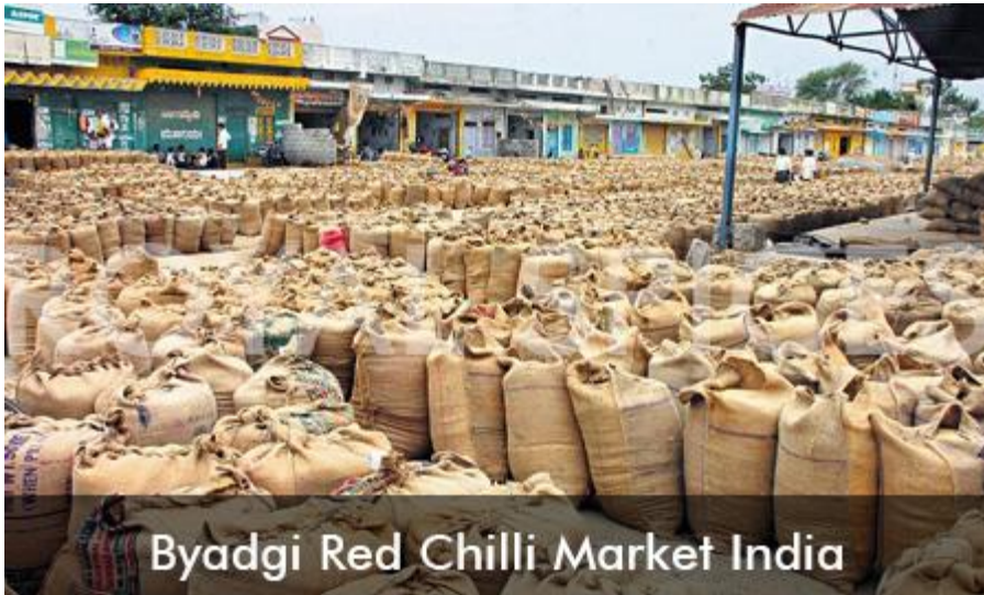
Byadgi Red Chilli Market India