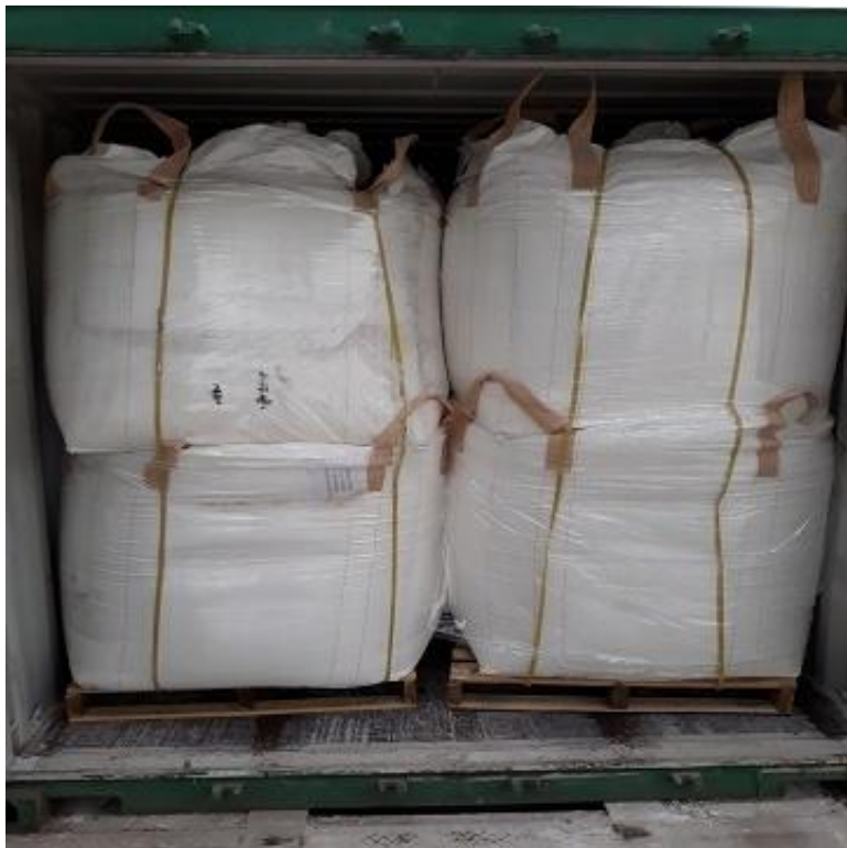
Chilli powder in Jumbo bags