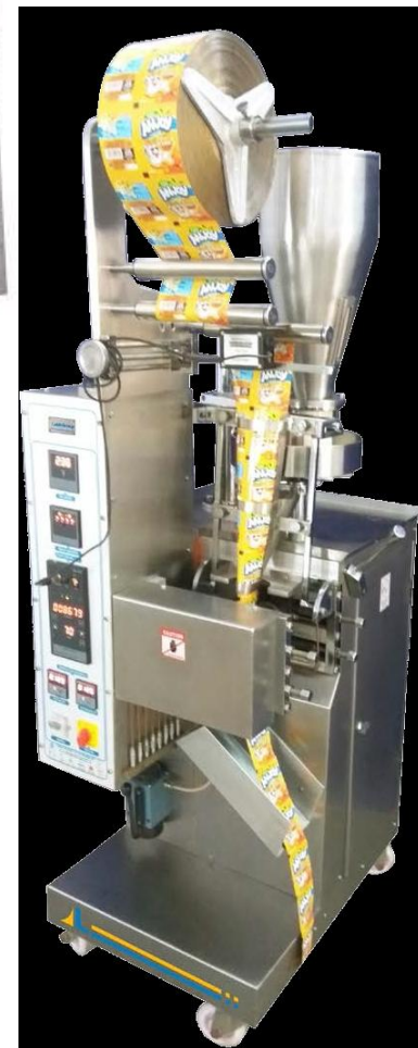
Chilli flakes packing machine