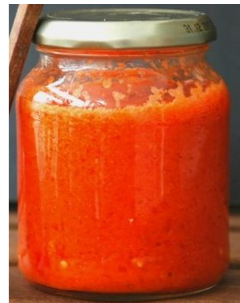
Byadgi chilli paste