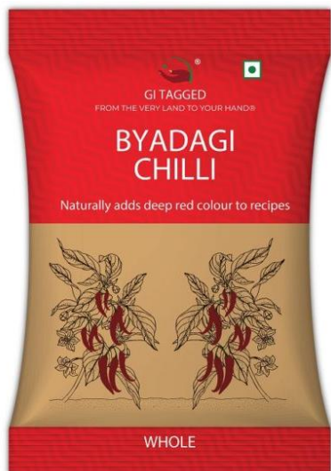
Whole dried Byadgi chilli packs-200g