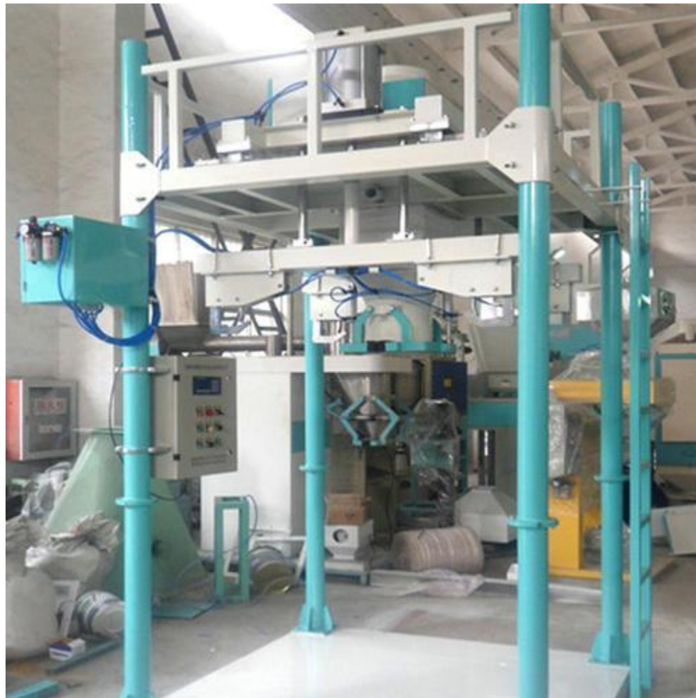
Chilli powder in Jumbo bags