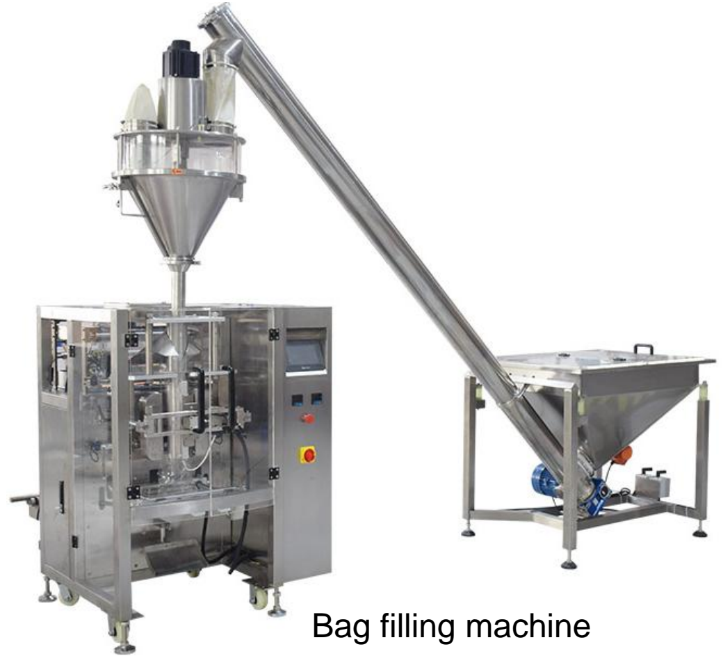
Bag filling machine