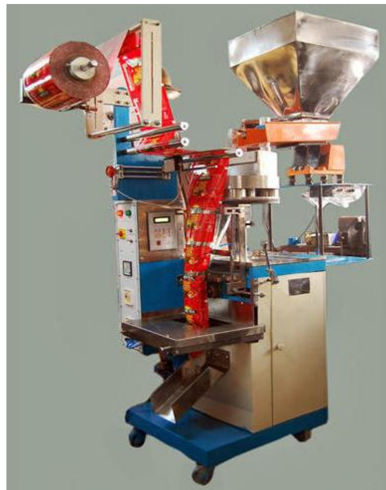
Machine for packing dry chillies in pouches 12