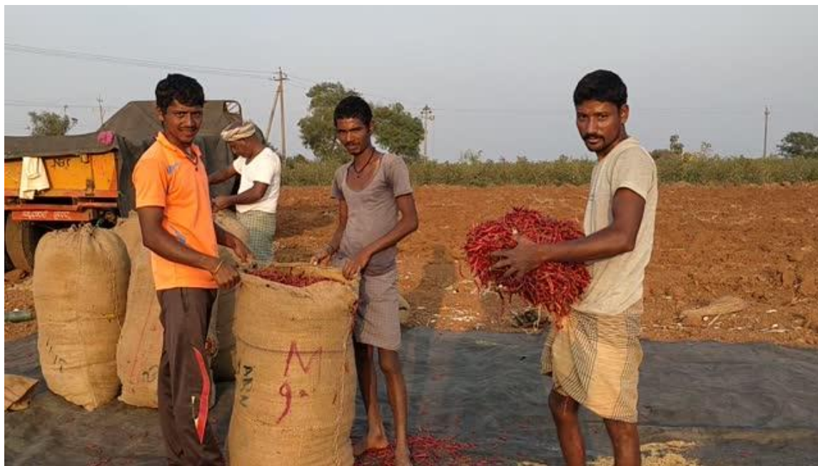
Packing in gunny bags