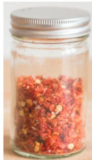
Chilli flakes in glass jar