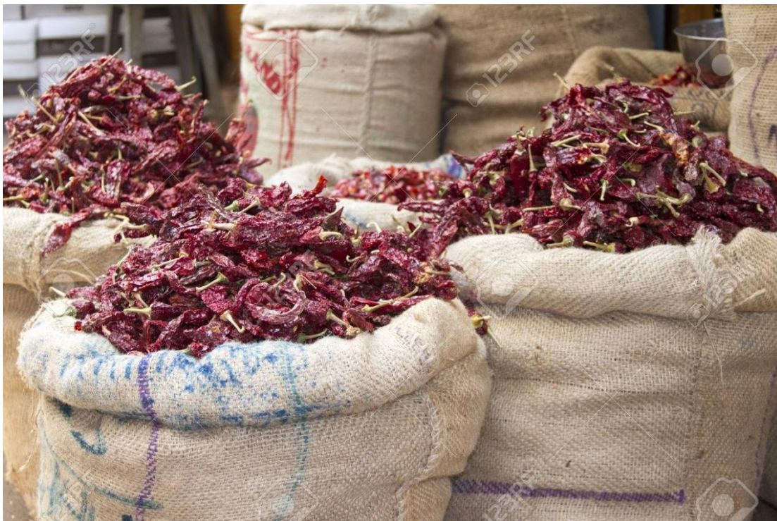
Use of gunny bags