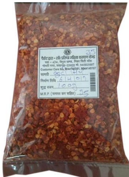
Chilli flakes in pouch