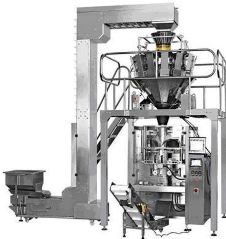
Chilli powder 100 g – 1 kg packs