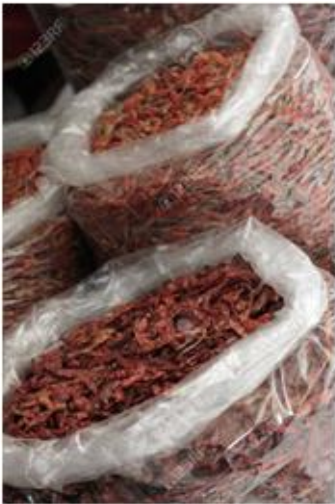
Use of polythene bags