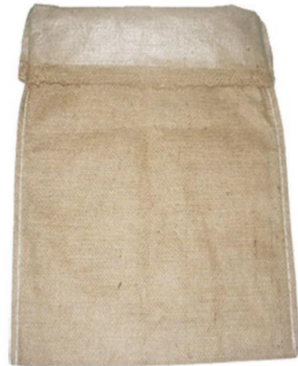
Gunny bags with polythene liner