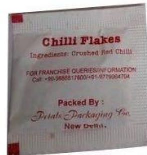
Chilli flakes sachets