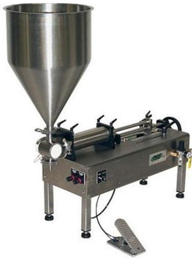
Piston Filling Machine