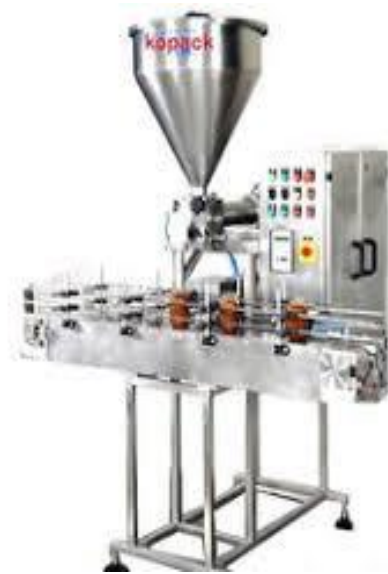
Semi Automatic Bottle Filling Machine