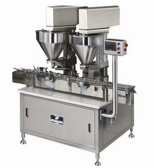
Automatic Double Head Power Filling Machine