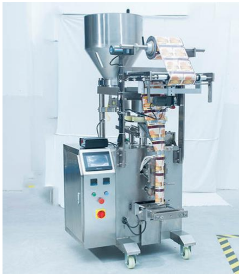
Semi Automatic Filling Machine