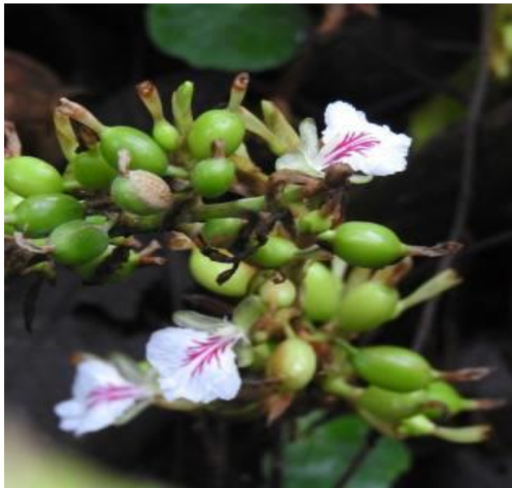
Fig 1: Cardamom fruit and flower bearing stock

The cardamom plants start bearing two to three years after planting. Panicles appear from the base of the plants, it is generally starting to appear on January on ward. The flowering starts from April to August or even after. The peak stage of flowering is May to June. Maturing time for fruit is up to 120 days after flowering. Fruits are small trilobular capsules containing 15-20 seeds. On maturity, seeds turn dark brown to black. Healthy cardamom plant produces about 2000 fruits annually, weighing about 900g. Harvesting commences in August- September and extends into February- March of the next year.