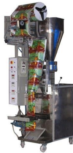
Fully Automatic Filling Machine