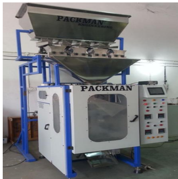
Fully automatic bottle filling machine