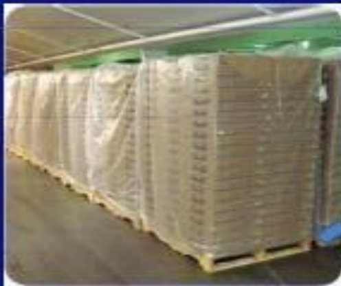
for bulk packaging

by adsorption on zeolite or other porous materials (e.g., activated carbon) impregnated into a LDPE film