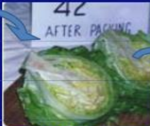
for retail packaging