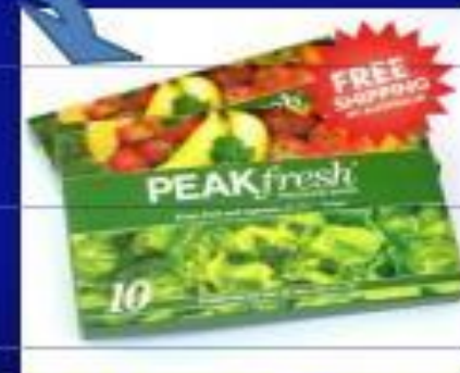
bags for domestic use