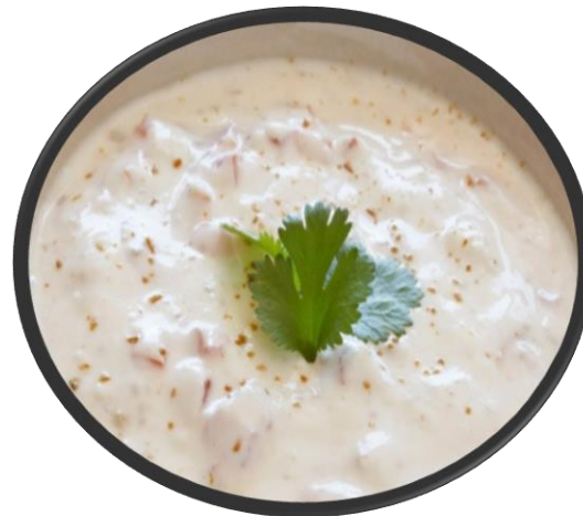
Dahi ke raita