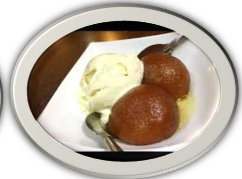
Gulab Jamun with Ice cream