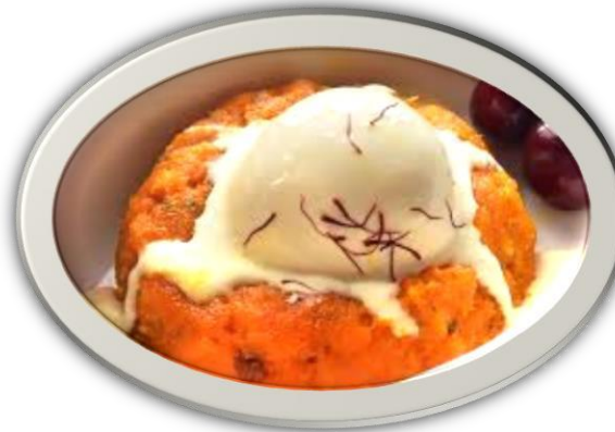
Gajar ka Halwa with Ice cream