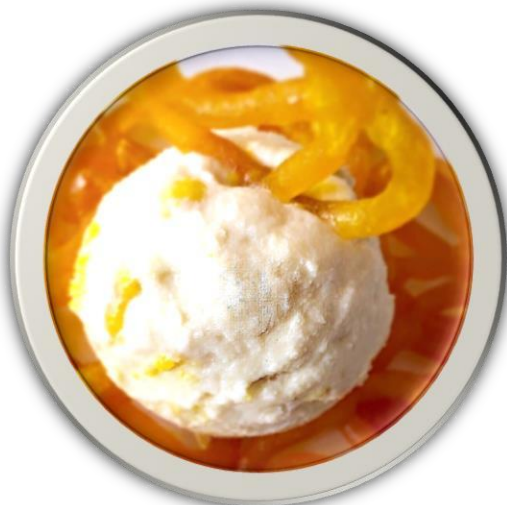
Jalebi with Ice cream