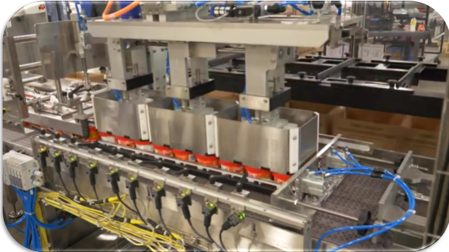
Ice cream packaging line (cups are putting in a carton)