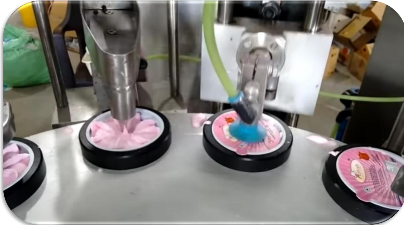
Ice cream cup filling and packaging line