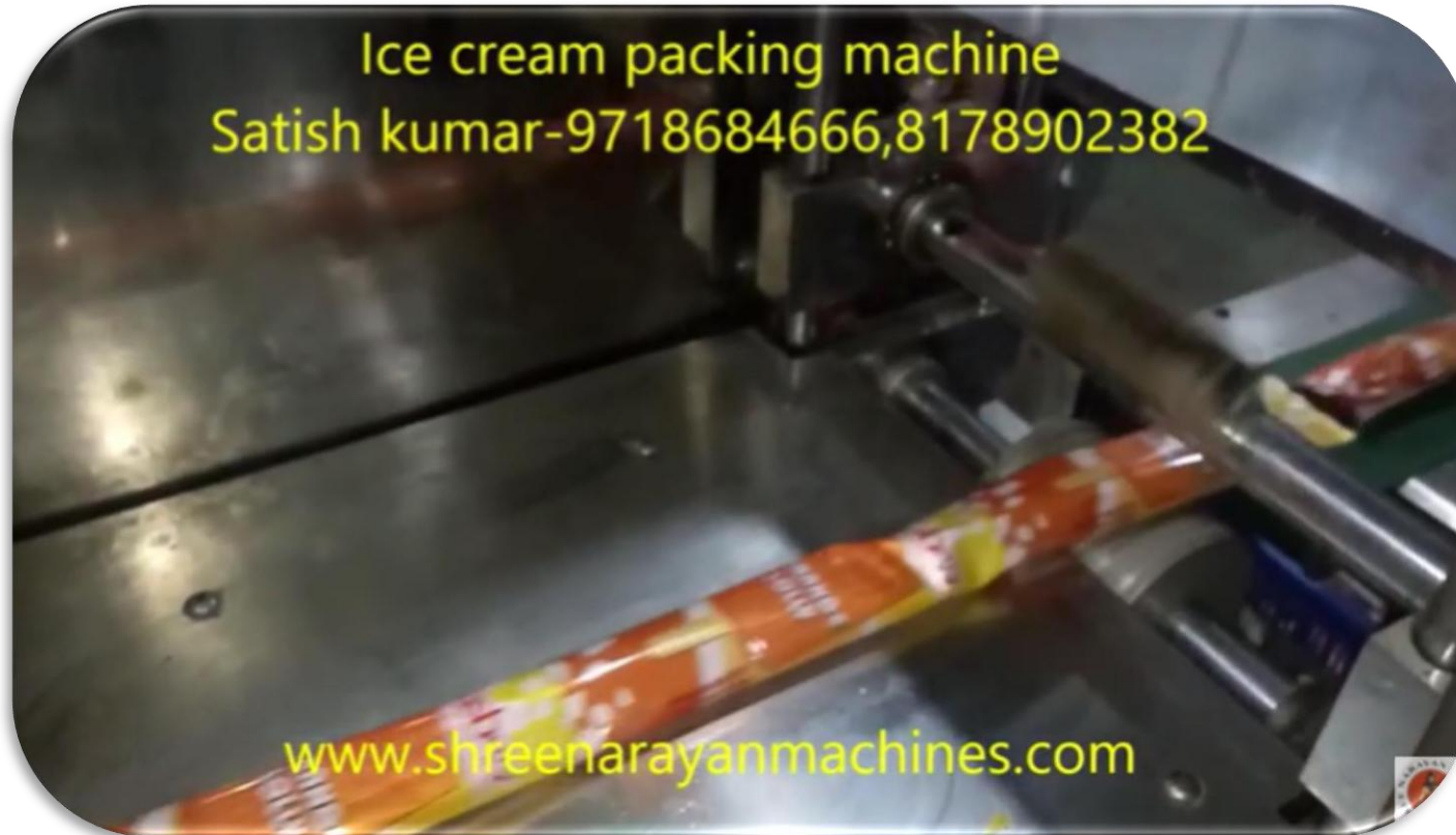
Ice cream lolly packaging line.