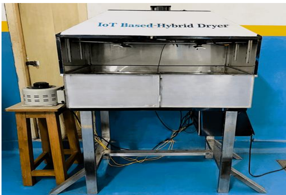
IoT Based-Hybrid Dryer