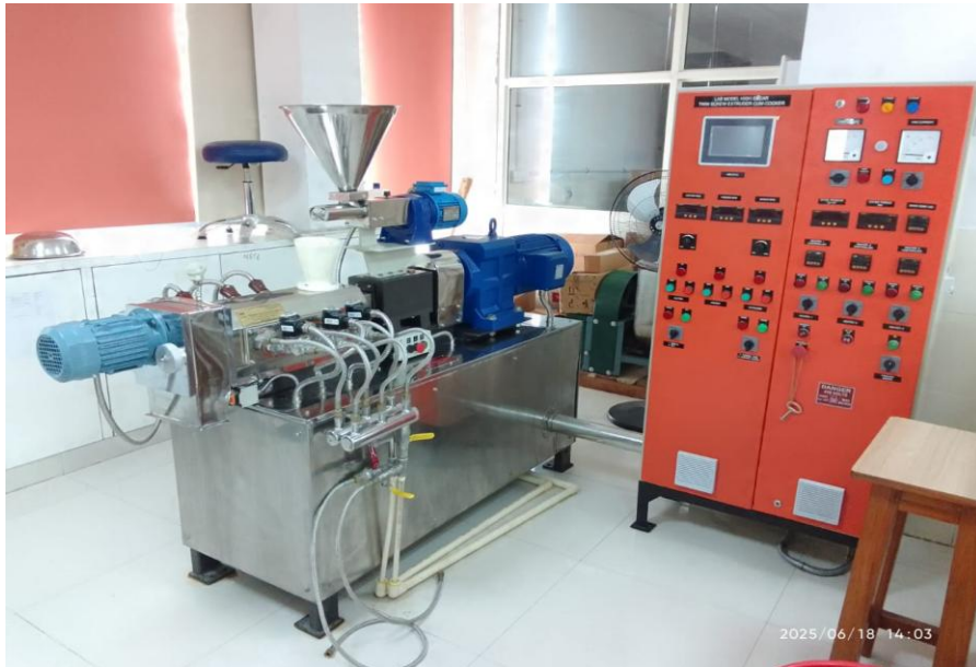
Twin screw extruder