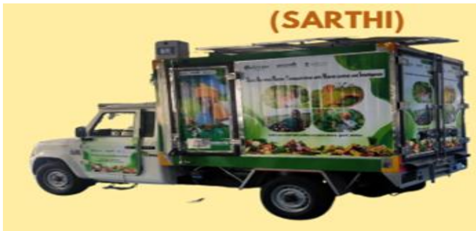
Solar Assisted Reefer Transportation with Hybrid controls and Intelligence (SARTHI)

The available infrastructure includes Solar Assisted Reefer Transportation with Hybrid controls and Intelligence (SARTHI), IoT enabled IR- assisted refractance window dryer, Boondi Dispenser Machine, Infrared assisted Evacuated tube Hybrid solar dryer, Coconut Water Extraction Equipment, twin screw extruder as well as can reformer, can seamer. As part of the empanelment, the selected fabricators may also be required to assist in the routine maintenance, servicing, and repair of these facilities, subject to institutional guidelines. This ensures optimal operational efficiency and extends the service life of critical equipment. The fabricator must have the technical expertise and readiness to address breakdowns or calibration needs in coordination with the institutional technical team.