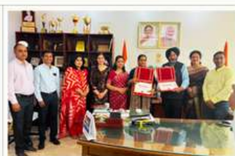
Technology Transfer of Biofortified Mushroom Flour