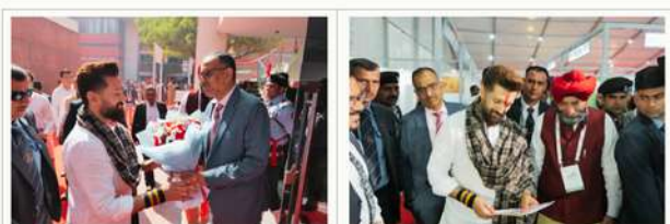
Hon'ble Minister MoFPI during ANVESH-2026 at NIFTEM-K