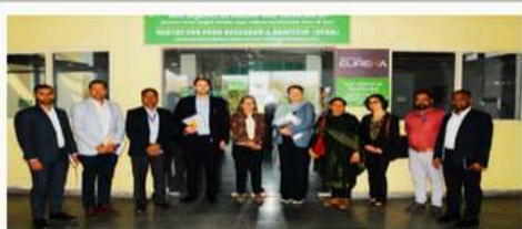
Novo Nordisk Foundation, Denmark delegation to NIFTEM-K