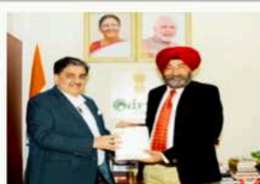
Chairman, ICEA with Director, NIFTEM-K