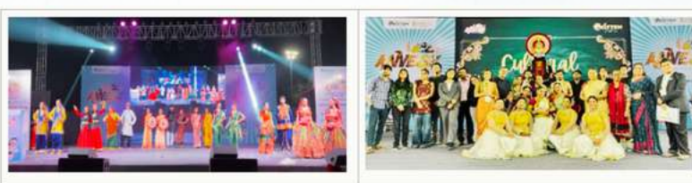
Cultural festivities during ANVESH 2026