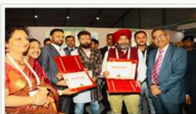
Technology Transfer of Millet Processing Technologies