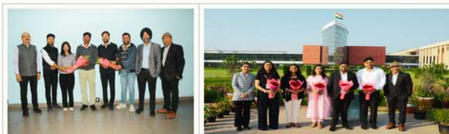
Amul (GCMMF) team visited Campus on 9 th February 2026 for

The Placement-2026 drive was initiated by Team CRC. Leading companies in food processing sector like Amul (GCMMF), Mother Dairy, AWL Agri Business Ltd., Camline Fine Sciences, Barmalt Malting India, GreyB, Country Delight and Bacardi offered the placements to our students. So far 38 B.Tech, 29 M.Tech & 7 MBA students have secured placements. Around 40 students have also secured internship opportunities as full-time interns.