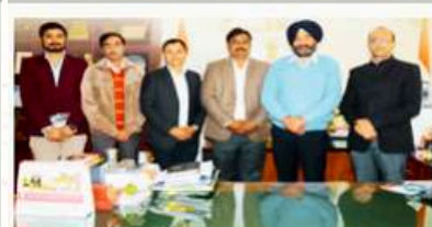
Team SNL Innovations at NIFTEM-K