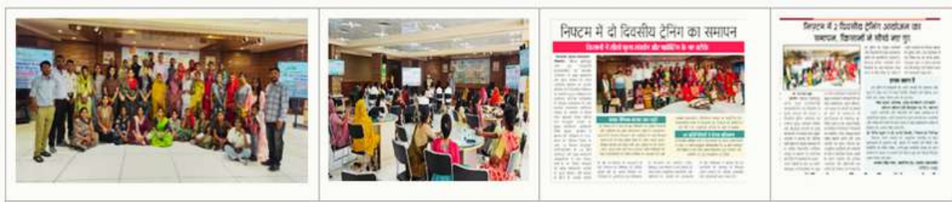
Capacity building programme for MSME

Click the link to access detailed information