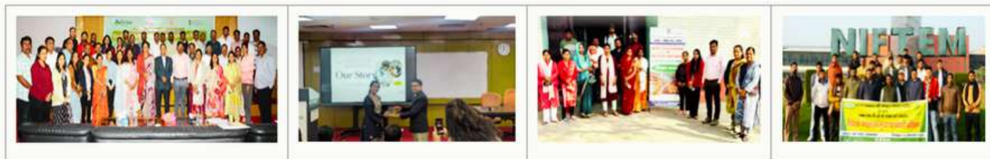
Training on Food Processing Techniques

The trainings and sessions directly benefited at least 261+ participants including students, researchers & academicians, farmers & FPO members, government officials & field staff, industry professionals & MSMEs, women & rural youth. Significant participation was observed in major programmes like NTIBIF workshops and hands-on trainings.